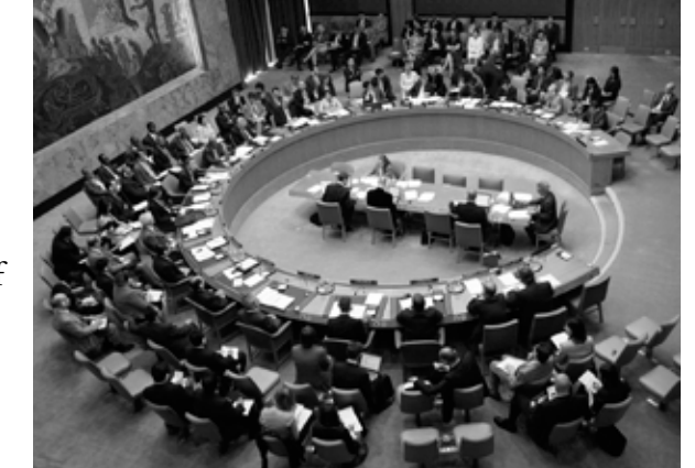
Security Council considers post-conflict peacebuilding. Photo #404677, UN Photo/Paulo Filgueiras

Yet instead of investing more in political engagement and tools for conflict prevention, the international community has continued to rely