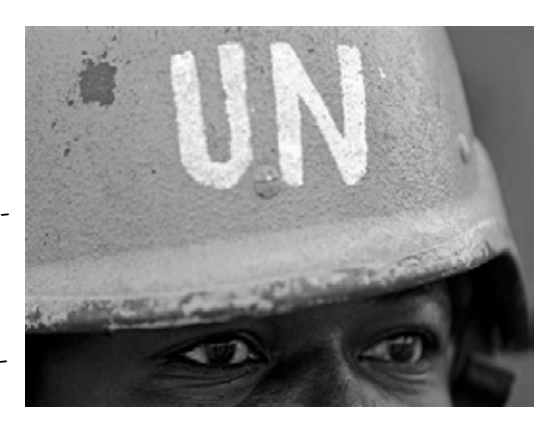
UN Peacekeeping Forces mark the transfer of control of Timor-Leste to East Timorese forces, July 23, 2002.

the UN Secretariat, is building on the Brahimi Report and subsequent initiatives. These two strands will begin to merge over the course of this summer, following circulation later this month by the Secretariat of a non-paper that will suggest improvements in the design, tasking, manning and support of missions, in time for discussion during a debate in the Security Council in August. The aim is for all concerned — Security Council members, troop, police and financial contributors