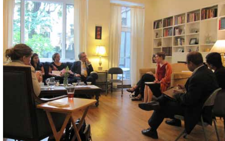
Quaker House guests learn more about ongoing peace efforts in Myanmar.

Discussion focused on the numerous peace processes currently taking place between the government and ethnic armed groups. By Rachel's estimation