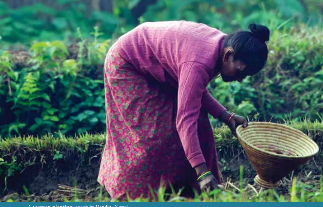
A woman planting seeds in Bardia, Nepal