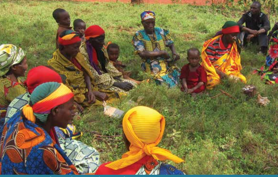
A meeting of a Women's Saving Circle in Burundi