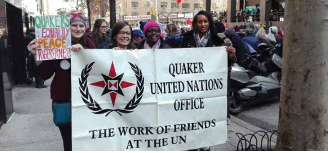
QUNO staff participate in the Women's March in New York City