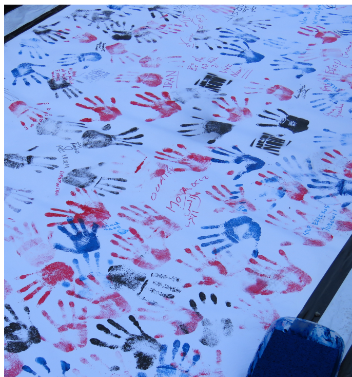
A poster at the 6th World Congress Against the Death Penalty in Oslo.

This issue is most relevant in those countries that continue